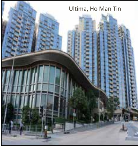
Ultima, Ho Man Tin