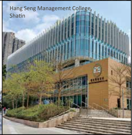
Hang Seng Management College, Shatin