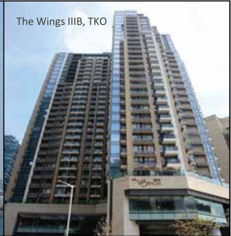
The Wings III B, TKO